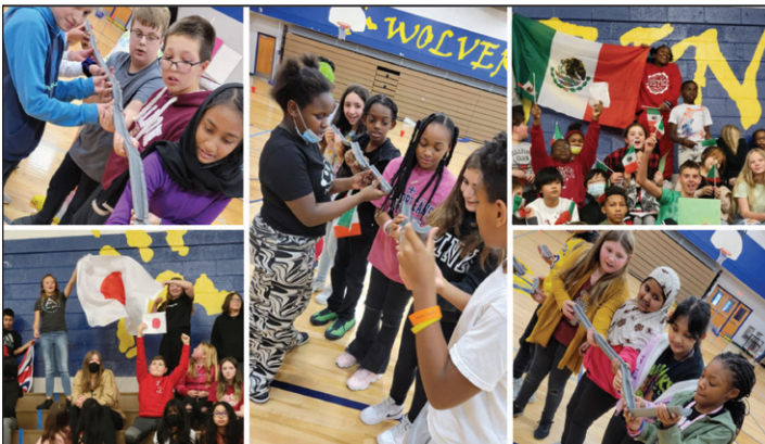
On Friday, November 18, 2022, eligible students participated in our WWMS First Quarter PBIS Incentive – WWMS Olympics!