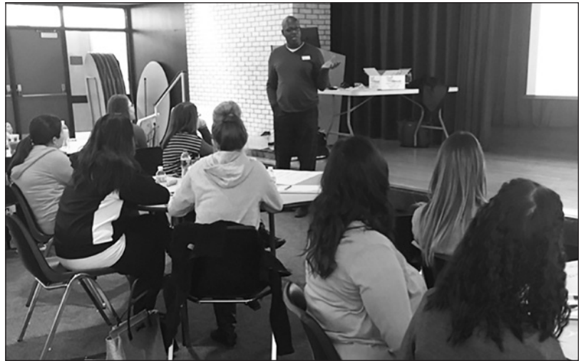
Preschool staff members were able to participate in a HighScope Training due to a grant received.