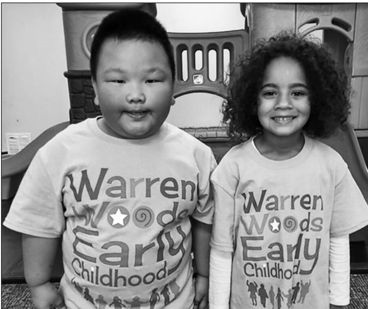
The Warren Woods Early Childhood Center loved the t-shirt fundraiser.