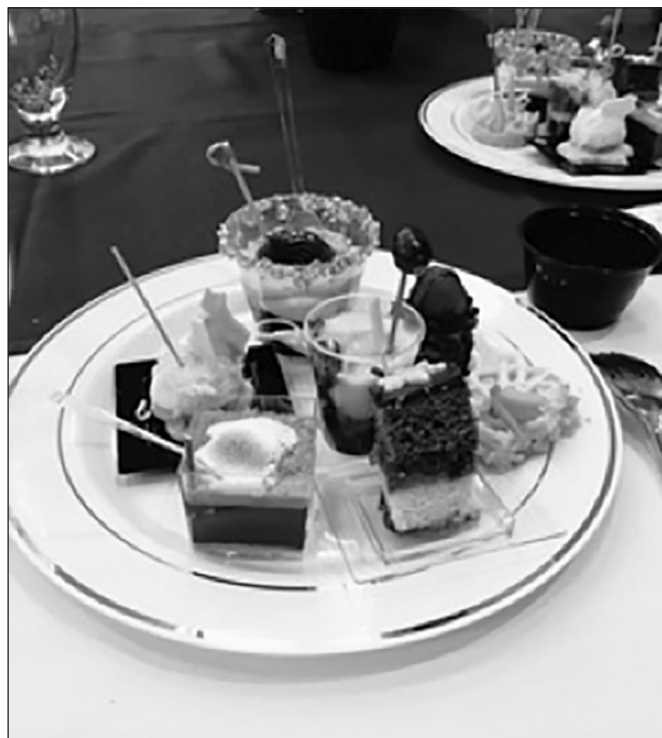
The winning desserts!