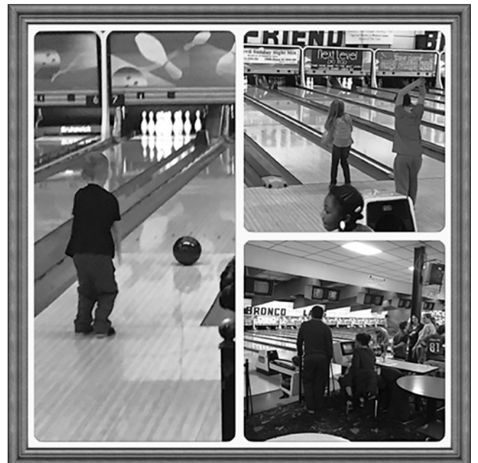
Title I Family Engagement Bowling Event. Families were able to participate in a fun filled evening with friends and families from all three elementary buildings.